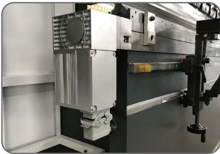
CNC Crowing System