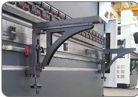
Front Arm with Linear Guide