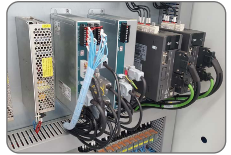
Delta Servo Drive