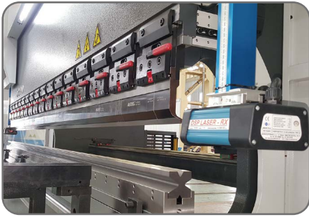
CE Confirmation with Laser Safe