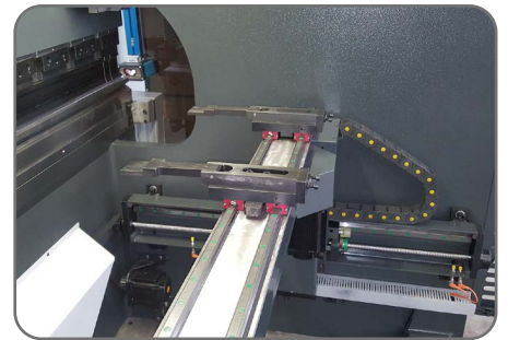
Back Gauge with Linear guide